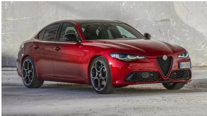
New Front Grille Design