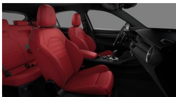
Veloce ( Full Leather )