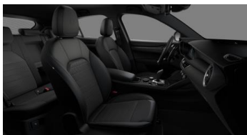
Sprint (2 Tones Leather x Fabric)