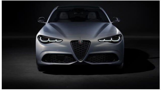
New Matrix LED Headlights