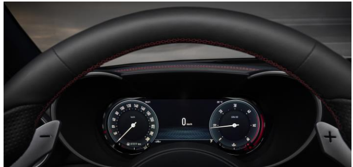
Fully Digital Cluster